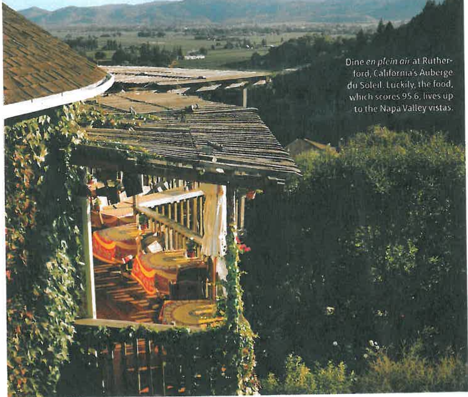
Dine en plein air at Rutherford, California's Auberge du Soleil. Luckily, the food, which scores 95.6, lives up to the Napa Valley vistas.

For full reviews of every hotel and resort on the 2011 Gold List, with reader quotes, go to cntraveler.com/goldlist . (Or download our soon-to-be-released iPhone or iPad app: Condé Nast Traveler's 2011 Gold List.)