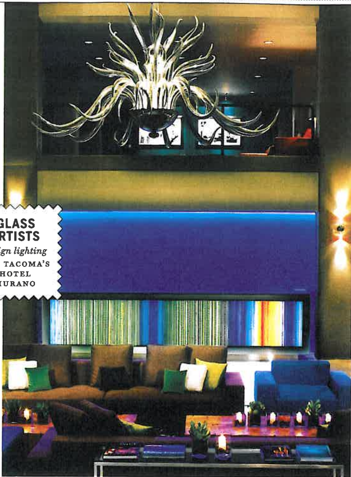
GLASS ARTISTS design lighting FOR TACOMA'S HOTEL MURANO