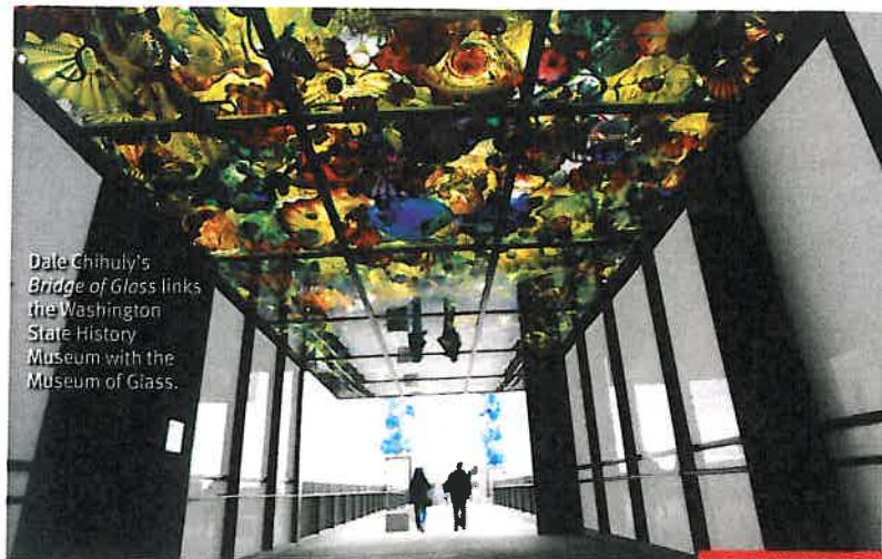
Dale Chihuly's Bridge of Glass links the Washington State History Museum with the Museum of Glass.