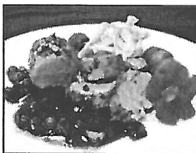
The special: Pistachio Crusted Pork Tenderloin