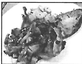
The special: Black Butte Porter Marinated Pheasant