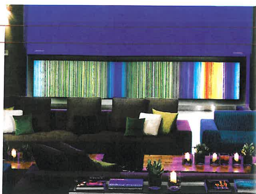
Left to right, Greater Tacoma Convention & Trade Center; Hotel Murano front desk; Venetian Wall of Chihuly Bridge of Glass; Chambers Bay Pure Links Golf.